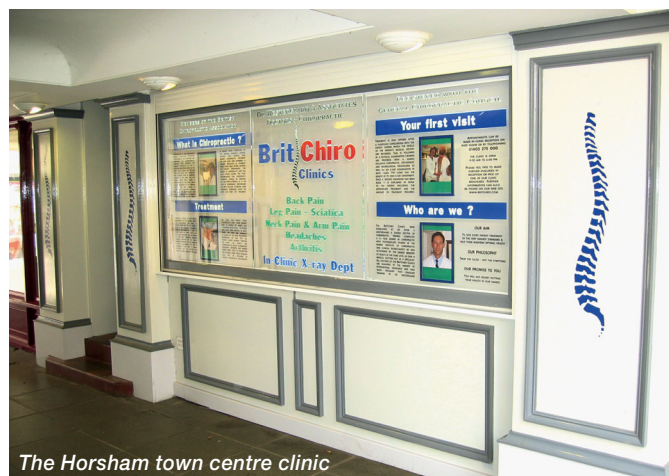
The Horsham town centre clinic

broken and that she should just take it easy for a while. It wasn't until she began to get pain into her left shoulder and hand that she decided to seek help at BritChiro. Examination and X-rays showed that her shoulder and hand pain was due to spinal restrictions in her neck, which despite being so long standing still were correctable through Chiropractic adjustments. When her neck was adjusted she felt a 'crack', which she had been explained about. It was an unusual experience but didn't hurt at all. After an intensive course of Chiropractic treatment she is now pain free, can move without restriction and only needs an adjustment every six to eight weeks to keep the good results.